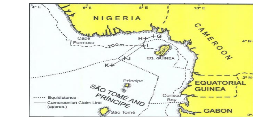
Figure 1. Cameroon v. Nigeria 2002 47

At the same time, Nigeria contended that, “under contemporary German domestic legislation, all treaties providing for cession or acquisition of colonial territory by Germany had to be approved by Parliament”. It points out that the Anglo-German Agreement of 11 March 1913 was not so approved. It argues that the Agreement involved the acquisition of colonial territory, namely the Bakassi Peninsula, and accordingly ought to have been "approved by the German Parliament, at least so far as its Bakassi provisions were concerned". 46