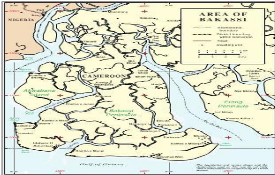
Figure 3. Area of Bakassi 66